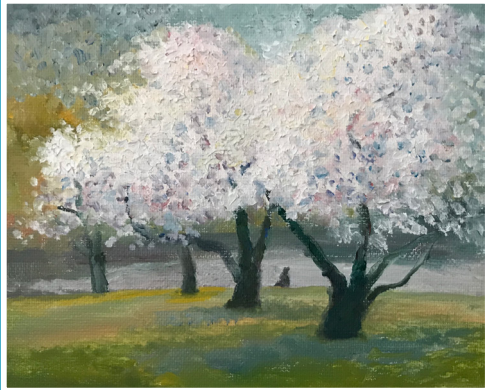
JOHN SEVCIK, A Study of Spring

SEE OUR WEBSITE FOR A FULL LISTING OF CONCERTS/CLASSES AT ELKINS CENTRAL, OUR VENUE AT THE ELKINS PARK TRAIN STATION